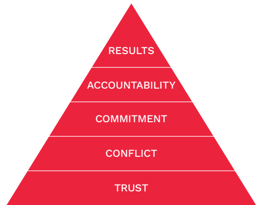
The Five Behaviors Model

The experience is completed through a half-day training session, led by a trained Five Behaviors expert. This session includes a walkthrough of the Personal Development profile, breakout activities, and group discussion.